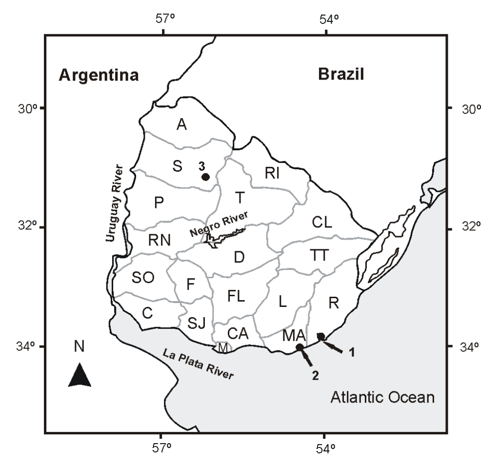
FIG. 1. Map of Uruguay showing the 19 Departments, the main Rivers and location of Rocha Lagoon (1), José Ignacio Lagoon (3) and Cuchilla de Arerunguá (3). A = Artigas, S = Salto, P = Paysandú, RN = Río Negro, SO = Soriano, C = Colonia, SJ = San José, F = Florida, FL = Flores, D = Durazno, CA = Canelones, M = Montevideo, MA = Maldonado, L = Lavalleja, R = Rocha, TT = Treinta y Tres, CL = Cerro Largo, T = Tacuarembó, and RI = Rivera.