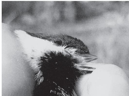
Figure 2. Upper mandible lining (scored as “3”) of a Black-capped Chickadee.