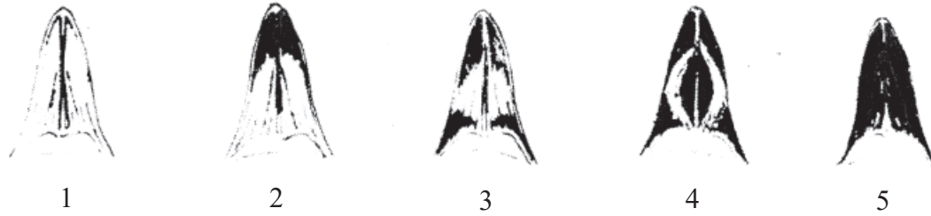
Figure 1. Illustrative scale of mandible lining color scale from 1-5.