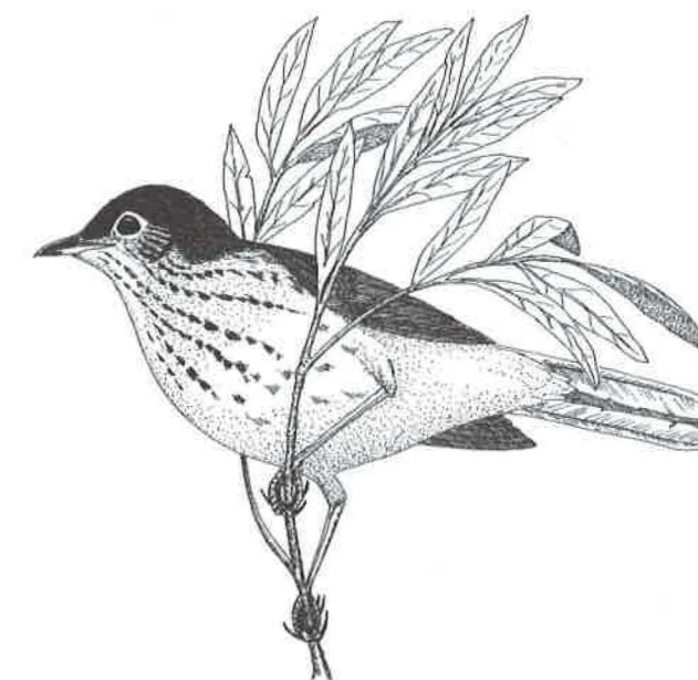
Swainson's Thrush by George West