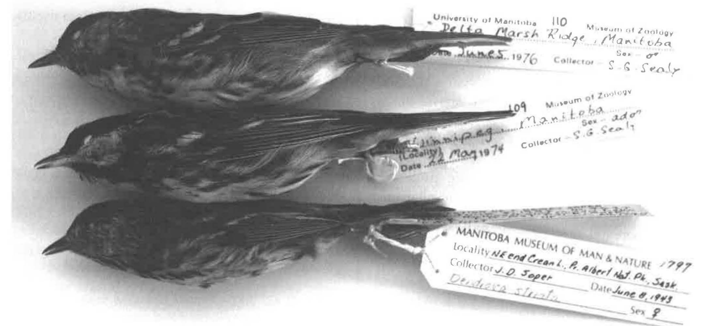
Fig. 1. Top: second-year male Blackpoll Warbler with female-like plumage (UMZM 110), Delta Marsh, MB, 5 Jun 1976. Middle: after-second-year male Blackpoll Warbler in typical plumage (UMZM 109), Winnipeg, MB, 22 May 1974. Bottom: second-year female Blackpoll Warbler (MM 1797), Crean Lake, Prince Albert National Park, SK, 8 Jun 1943.

Because documentation of the female-like plumage of the male Blackpoll Warbler from Manitoba is supported by a photograph, I note here only differences in the plumage of the Vermont and Manitoba birds. Both birds' crowns were greenish-gray but instead of 10-12 feathers on the forecrown being more heavily tipped with blackish than others, as in the Vermont bird, most crown feathers were tipped with black in the Manitoba bird (Fig. 1). Nevertheless, both individuals lacked the solid black-crown of typical alternate-plumaged males. Small, black pre- and post-ocular spots were not apparent in the Manitoba bird, and the mantle and back feathers possessed the black central streaks typical of alternate-plumaged males, not just the 8-10 feathers with prominent black centers exhibited by the Vermont bird. In both birds, the rump and upper-tail coverts were greenish with indistinct dusky centers. The lesser coverts were grayish with little streaking, as in the Vermont bird, but the median and greater coverts of both birds were composed of mixed feather generations. The 5-6 proximal coverts on each wing were darker, fresher and more broadly tipped with grayish (not white as in the Vermont bird) than the distal coverts, which were duller, grayer and more narrowly tipped (worn) with yellowish white. The tips of