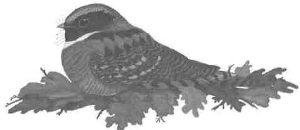
Eastern Whip-poor-will by George West