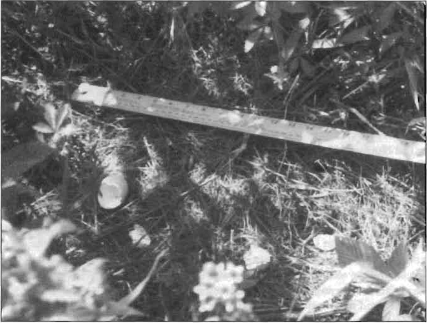
Figure 1. Northern Harrier nest found in Stewart County, Tennessee, 2002. The nest cup is in the lower right corner, and the larger piece of broken egg shell is in the middle left. There are three other broken egg shell pieces visible from the two eggs. The yard stick appears in the image for scale.