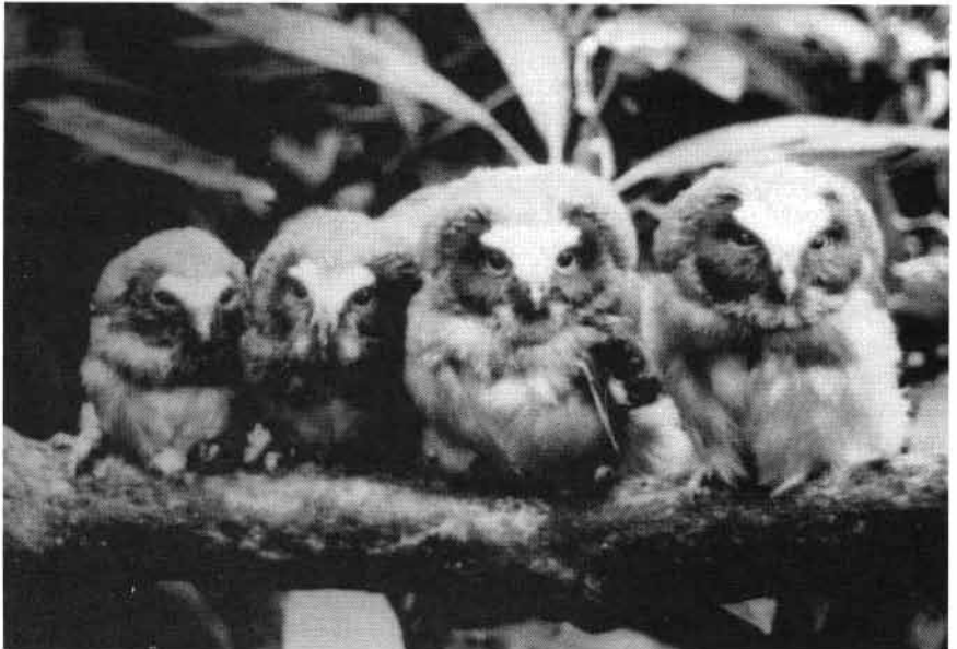
Fig. 2. The young birds were banded on 24 August just before they fledged.