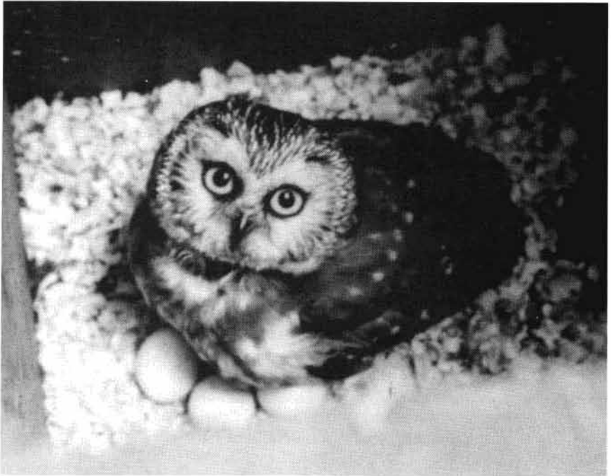
Fig. 1. On 12 July, while the author examined the eggs, the adult female owl flew back to the nest, clicked her bill defiantly, and placed herself down on the eggs.