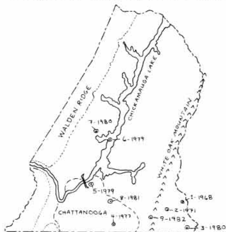
Figure 1. Distribution of the Brown-headed Nuthatch in Hamilton County, Tennessee. See text for descriptions of numbered locations. Years refer to first observation at a location.

(Location 1 on Figure 1). Open woodlands of large (greater than 25 cm dbh) loblolly pine ( Pinus taeda ) and shortleaf pine ( P. echinata ) with grass understories extend 0.5 km south, 3.0 km north, 0.7 km west (including Sherry Lane), and 2.0 km east of the intersection of the two roads. Most of the land is residential or pasture. Several areas contain nearly pure stands of pines. The elevation is between 250 and 300 meters.