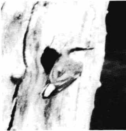
Figure 2. Brown-headed Nuthatch at nest cavity on 12 April 1981, at Roach residence, Hamilton County, Tennessee.