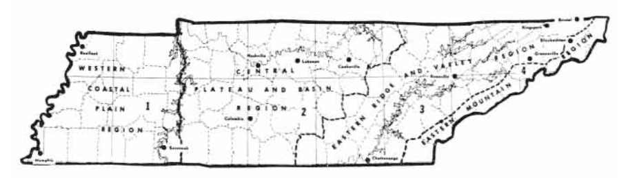
NESTING SEASON: 16 MAY - 31 JULY

What a most interesting nesting season report! There were many good birders in the field and they found many late migrants and stragglers, some wandering visitors from farther south, some nesting by uncommon species, and some challenging problems that must wait until at least next year's nesting season before they can be answered. In addition to the information presented in the following pages look at all the things we don't know about the species which frequent Tennessee in the summer and make yourself a personal project to add some new information about the State's breeding avafauna next year. Find for yourself the most exciting birding is after the spring migration!