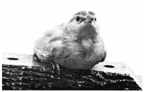
Fig. 1. A dilute albinistic Western Meadowlark collected in Arkansas.

A dilute form of albinism occurred in a Western Meadowlark collected by Mr. Elbert Hawkins from a flock of ca. 20 birds 4 February 1971 near Manila, Mississippi County, Arkansas (Fig. 1). This specimen has dilute markings but could be identified as the western species by the markings in the rectrices. The color of the back and wings is light buff. The tail is almost white with visible and identifiable markings. The flanks are light buff and the belly region is