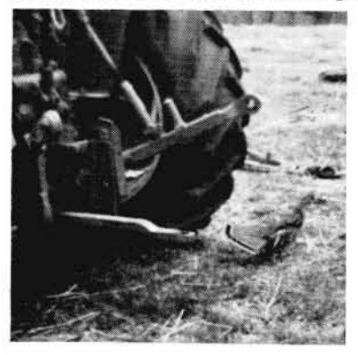
RUFFED GROUSE AND TRACTOR

AN ACCOUNT OF A RUFFED GROUSE WITH A TRACTOR—Our first encounter with our Ruffed Grouse (Bonasa umbellus) was in the Spring of 1963. My husband came in from the fields on the farm tractor and the grouse came flying over from behind and lit on the ground in front of the tractor where he sat and apparently waited for my husband to catch up and pass him. He repeated this procedure twice but was finally frightened away by our dog who came to investigate.