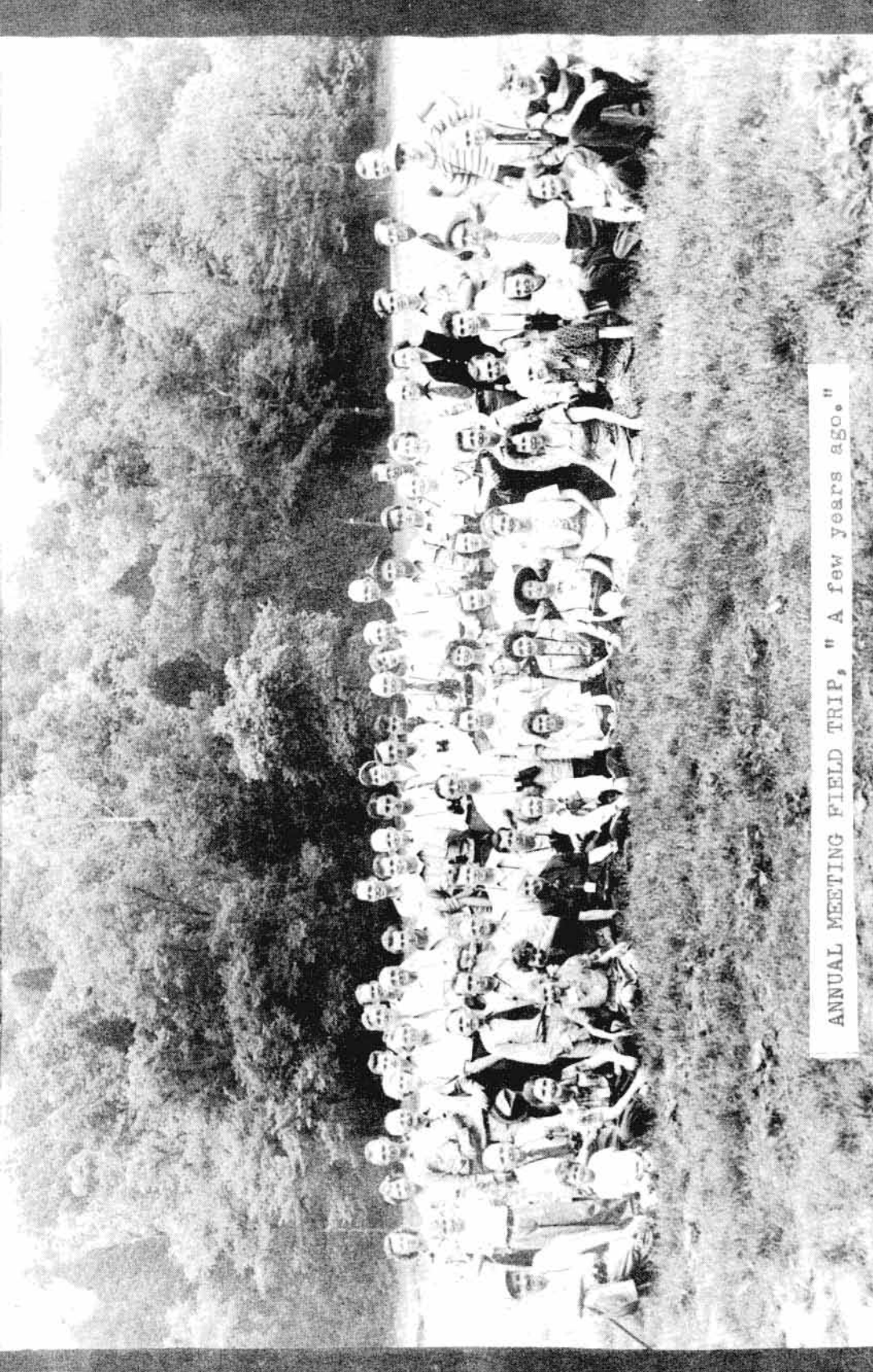
ANNUAL MEETING FIELD TRIP, "A few years ago."