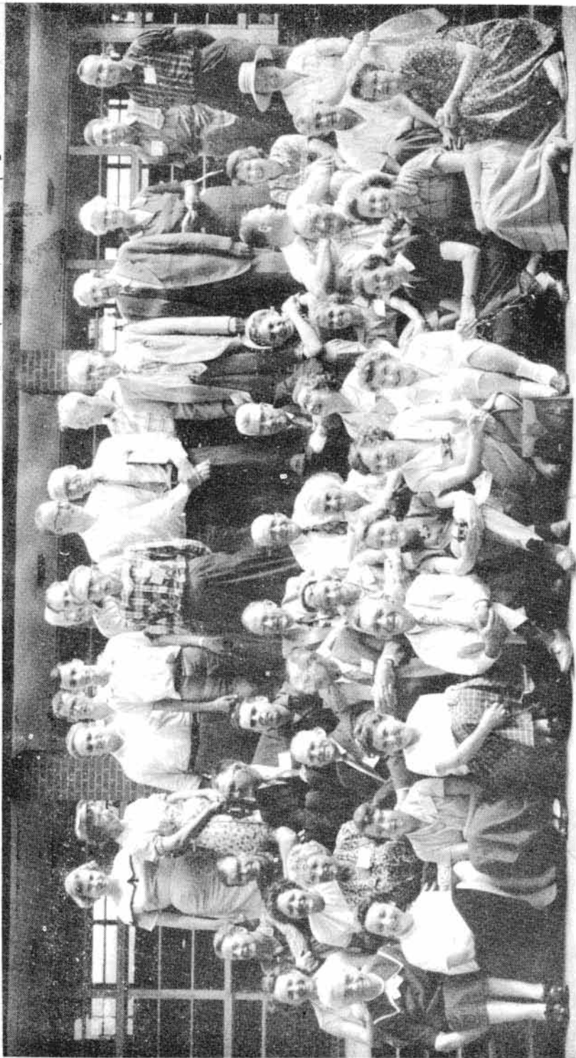
T.O.S. ANNUAL MEETING, NASHVILLE, MAY 1-3, 1959. For key to picture, see last pages this issue.