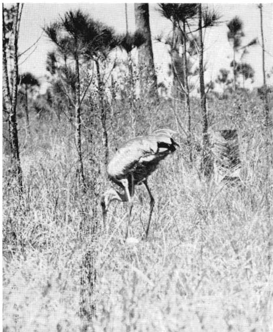
FLORIDA SANDHILL CRANE ( Grus canadensis pratensis ) NEST, EGG AND HABITAT