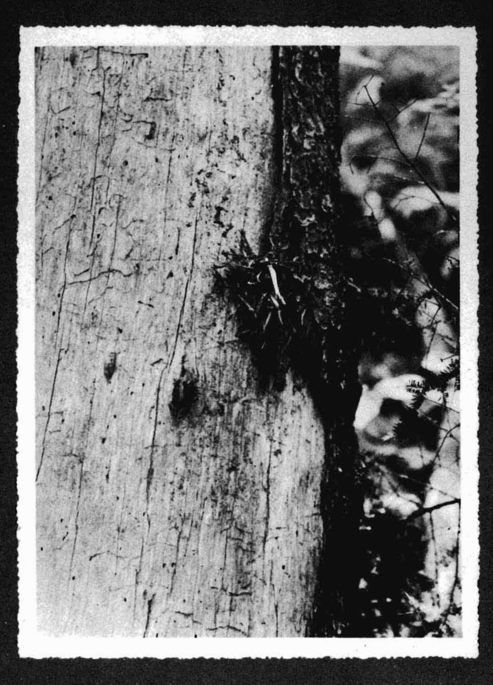
* Nest of Brown Greeper