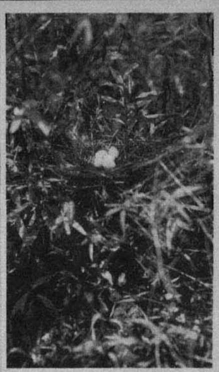
Nest of King Rail