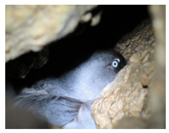
Fig. 4. Incubating adult Cassin's Auklet in nest #2 on Rat Rock, West Anacapa Island. Note the white iris typical of breeding adults and older subadults.

Thus far, most auklet nests at Anacapa have been found in rock crevices, but continued population growth for auklets and other crevice-nesting seabirds will eventually limit the availability of suitable crevices in current breeding areas. Some additional colony growth is possible at Rat Rock, Landing Cove, the Lighthouse, Portuguese Cove, and to a lesser extent Garbage Cove, where suitable vacant nesting crevices are still available. Little growth is expected on Cat Rock because of its small size