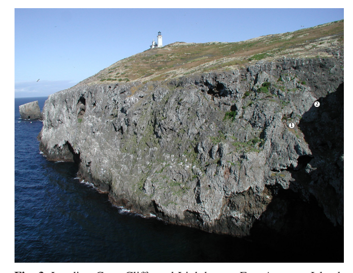
Fig. 3. Landing Cove Cliffs and Lighthouse, East Anacapa Island, and the approximate locations of Cassin's Auklet nests found in May 2008 (1, 2).

The first documented nesting of Cassin's Auklet in 2003 and subsequent growth of a small population from 2003 to 2012 has demonstrated additional unexpected benefits of rat eradication for