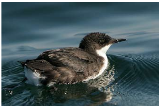
Fig. 2. Craveri's Murrelet at Isla Rasa, 28 May 2007.

Upon our arrival, the island was covered with gulls and pelicans. The latter had little ones while the former were beginning to lay eggs, which was a gift for our crew, and they ate them in large numbers. The pelican eggs that we found, in addition to not being edible, had little ones inside, [so] they were given to the pig we have on board. It was ridiculous to see that animal eat a bucket of eggs every day, and to hear the crunching of the little pelicans under its teeth, some of them moaning as their shell broke. All these birds abandoned the island after eight days of having seen nine or ten people continuously walking on it.... José Maria [the Chief Steward] killed two hawks, a big one and a little one, both with families. Sr. Guillet took two young of the big species which he keeps alive on board, and [which] are magnificent. He also killed a raven and collected beetles that apparently feed on bird carcasses [that are] abundant on the island. He also took a few scolopendrids and two species of small lizards, one with winged claws. I worked so much that I was almost unable to observe anything that was not related to my commission.