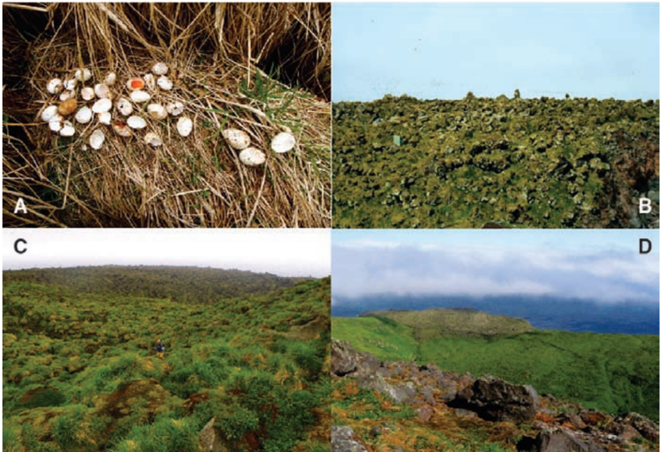
Fig. 2. A rat cache on Kiska Island with 29 Least Auklet eggs (left), and 3 Crested Auklet eggs (right) from June 2010 (A), the 1969 lava dome (B), Bob's Plateau (C), and entire auklet colony (D).