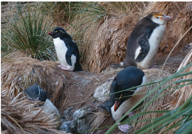
Figure 2. Royal Penguin (top right) next to Southern Rockhopper Penguins on New Island, Falkland Islands, 18 January 2011.