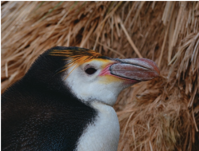
Figure 1. Royal Penguin on New Island, Falkland Islands, 18 January 2011. The head coloration shows the typical white cheeks.

While conducting fieldwork with Southern Rockhopper Penguins Eudyptes chrysocome chrysocome between 11 November 2010 and 24 February 2011, we visited the "Settlement Colony" (51°43'S, 61°17'W) of New Island, Falkland Islands, daily. On the morning of