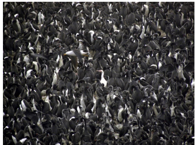
Fig. 2. General view of a small part of the colony of Guanay Cormorant with the albino on Isla Pescadores, Peru. (November 2011, Karine Delord).