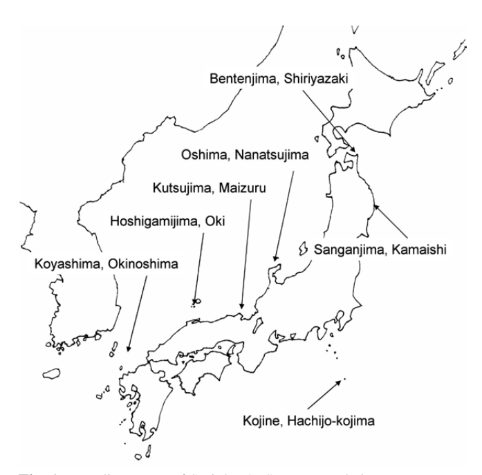
Fig. 1. Breeding areas of Swinhoe's Storm-Petrels in Japan.

Breeding of Swinhoe's Storm-Petrel Oceanodroma monorhis is only known on coastal islands in Japan, Korea, far-east Russia and China (Lee & Won 1988, Sato 1996, Kondratyev et al. 2000). Global population estimates range from 30 000 individuals (Boersma & Groom 1993) to 100000 pairs (Birdlife International 2009), far fewer than the closely related Leach's Storm-Petrel Oceanodroma leucorhoa (Boersma & Groom 1993). Most reports of O. monorhis are from observations or captures of birds outside breeding areas (Bailey et al. 1968, James & Robertson 1985, Bretagnolle et al. 1991, Cubitt 1995), whereas studies of the breeding biology of this species are very limited (Won & Lee 1986, Lee & Won 1988). In addition to having a limited population, some colonies of O. monorhis are threatened by human activities and introduced predators. Although several colonies are known to be active in Japan, most contain only small numbers of individuals (Sato 1996). Yoshida (1981) noted breeding of Swinhoe's Storm-Petrel on the Kutsujima Islands, Kyoto, Japan, but details of this colony had remained unexamined. Because the size of the Kutsujima Islands suggested the possibility of a large breeding population, we surveyed the colony and estimated the size of the breeding population.