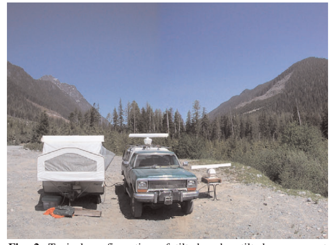
Fig. 2. Typical configuration of tilted and untilted scanners at inland site RS03.

The scanner was typically mounted on the roof of a truck, approximately 2 m above the ground. When two radar scanners were operated simultaneously, the scanners were placed at different heights to minimize interference (Fig. 2). The radar scanner was positioned in a location that maximized an unobstructed view of potential murrelet flight paths and minimized the quantity of foreground objects such as trees and shrubs that would result in ground clutter on the radar monitor. To increase the radar's sensitivity for detecting small objects such as murrelets, the sea and rain scatter suppressors were turned off, and the gain was set to near maximum (Burger 2001). Surveys were usually conducted with the range set at 0.75 nautical miles, giving a maximum