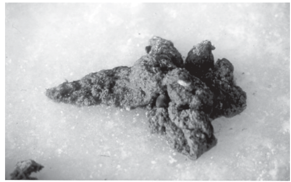
Fig. 2. Regurgitated stomach contents of an Emperor Penguin containing stones from the Dawson-Lambton breeding colony.