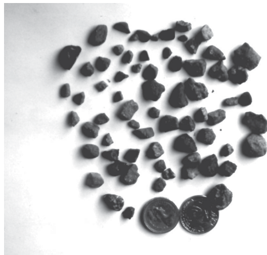
Fig. 3. Stones extracted from regurgitated material found in Emperor Penguin breeding colonies in the Weddell Sea. The coins are 24 mm in diameter.