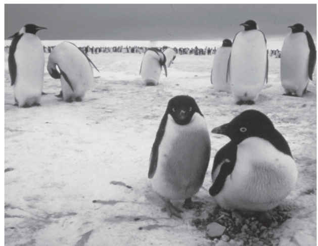
Fig. 4. Adélie Penguins with a stone-lined nest site breeding on ice at the Dawson-Lambton Emperor Penguin Colony.