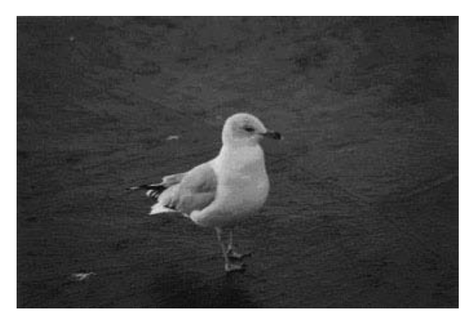
A Ring-billed Gull comes in for a closer look.

Also present was an adult Glaucous Gull. This beautiful gull kept our attention for some time, as we studied its various field marks. It appeared to be a smallish Glaucous Gull, similar in size to some of the Herring Gulls. However, the wing tips were all white, even when extended. A very pretty gull! Although 1st winter Glaucous Gulls have been reported at the pond from time to time, an adult was quite unexpected.