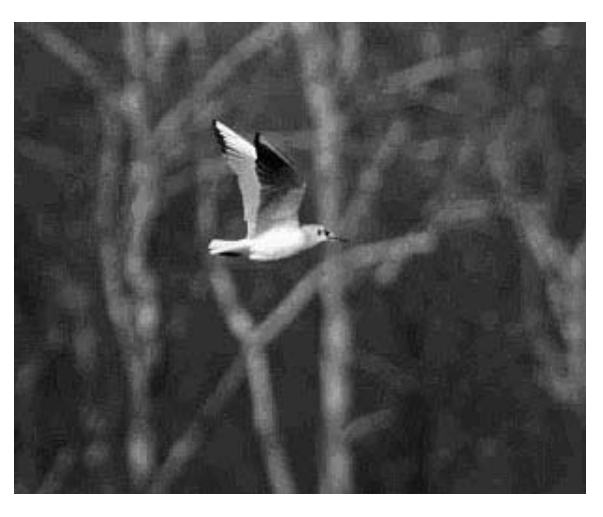
Black-headed Gull in flight.

Kevin Graff relocated the Mew Gull on the morning of December 26. However, for other birders, the gull proved tantalizingly elusive.