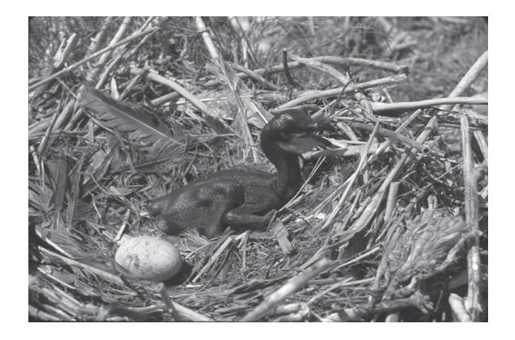
Double-crested Cormorant nest at Spring Island, Dorchester County, June 19, 1999.

Herons and Ibis. An American Bittern was seen on July 21 at Hollywood, not near any known breeding site (Rambo). Blom counted 61 Great Blue Herons at Havre de Grace on June 12. Two Great Blue Herons flying slowly, low over Cherry Creek in Pleasant Valley, Garrett County on June 13 before landing (Pope) may have been local breeders. The Great Blue Herons nesting in the colony at Vantage Point in Columbia had 10 active nests. Zeichner counted 17 young in the nests on June 27, Chestem noted 22-25 on July 19, and 3 full-grown young were still in one nest on August 3-4. An early dispersing Great Egret was at Liberty Lake on June 28 (Ringler) and a count of 26 at Wooton's Landing, Anne Arundel County on July 28 (Bystrak) was the high for the season. Jett found a Great Egret and 2 adult Little Blue Herons at Mattawoman Natural Environment Area, Charles County on July 5. The 11 Little Blue Herons at Elkton on June 4 (Watson-Whitmyre) were probably foraging from a colony