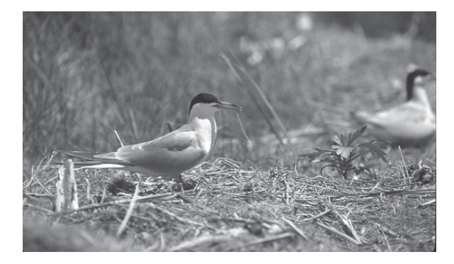
Common Tern at its nest, South Marsh Island, Somerset County.

Terns at Tanyard on June 4 and single birds there on July 25-26. At Lake Elkhorn 2 Caspians were seen on July 20 (Coskren). Three Royal Terns at Benoni Point, Talbot County on June 21 (H. Armistead) were unusual, while 28 at Morgantown on July 3 (Jett) and 34 at Deal Island WMA on July 11 (H. Armistead) were more expected. Brinker and Weske banded 490 young Royal Terns in the colony at Ocean City on July 14. Sandwich Terns were seen at Ocean City through the summer, including 2 on July 1 (Stasz, Hafner) and 4, 3 adults and 1 juvenile, on July 27 (Dyke), but none were known to have nested there. Single Sandwich Terns were seen at Point Lookout and Smith Island on July 30 (N. & F. Saunders). Craig estimated 80 Common Terns at Point Lookout on July 9. Interesting sightings of Least Terns were 2 at Greenbelt through early July (Mozurkewich) and 1 at Anacostia River Park on July 20 (Greg Gough). A Black Tern was seen over Chesapeake Bay off Smith Island on June 26 (Stasz, Miller, Jett), and Bystrak saw another over Jug Bay on June 29. A Black Skimmer was at Point Lookout on July 7 (Craig) and 1 at Chesapeake Beach on July 23 (Iliff).