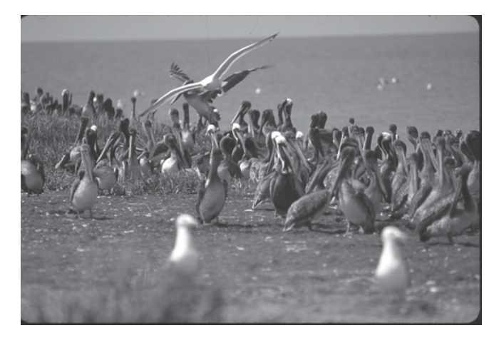
Young Brown Pelicans, Spring Island, June 19, 1999.