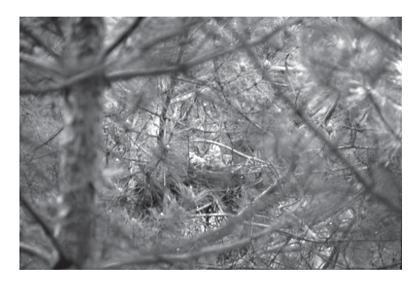
Nest with young Long-eared Owls, Garrett County, May 16, 2000.

Talbot County site on May 8 did not turn up any Long-eared Owls and revealed no evidence of nesting, though the search was not thorough enough to eliminate the possibility. Given the oft-cited difficulty of finding breeding evidence in this species, we deem it likely that the species persists as a regular nester in Maryland, though focused searches will be necessary to confirm this. Such searches should concentrate on known winter roost sites and in pine groves amid or adjacent to extensive suitable fields that are rich in rodent life, especially those known to host Short-eared Owls and Northern Harriers in winter.