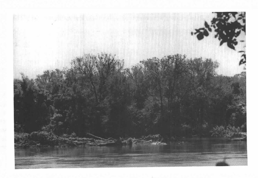
Figure 1. View across the Potomac River showing the major portion of the Great Blue Heron colony on Watkins Island (Nikon Series E Zoom 75-150 mm lens at 75 mm, FUJI 400 film).

On Monday, April 27, 1998, at the suggestion of bird watchers viewing the Great Horned Owl's nest near where Seneca Creek enters the Potomac River in Montgomery County, we went to observe the Great Blue Heron rookery on Watkins Island in the Potomac River between Swain's Lock and Pennyfield Lock. The rookery can be viewed easily from the C&O towpath at milepost 18.3 (a stick with a red ribbon having 18.3 printed on one side) and is best reached going approximately one mile southeast from Pennyfield Lock on the C&O towpath. An 8 to 10 a.m. viewing is encouraged to benefit from proper lighting. A telescope, although not essential, is of definite value since the nesting site is approximately 1,000 feet across the Potomac River from the viewing area.