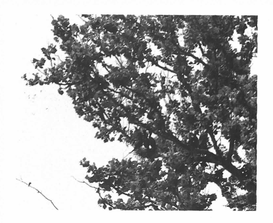
Figure 4. Adult Double-crested Cormorant with two young on nest (same lens and film as in Figure 3).

sitting on the nest. During our one mile hike to the viewing area, we saw a family of Double-crested Cormorants on a rock in the Potomac River approximately 100 yards from our vantage point on the C&O towpath. The family consisted of two adult and three immature birds. On our return hike to our car, the three immature birds were still situated on the rock but the adults