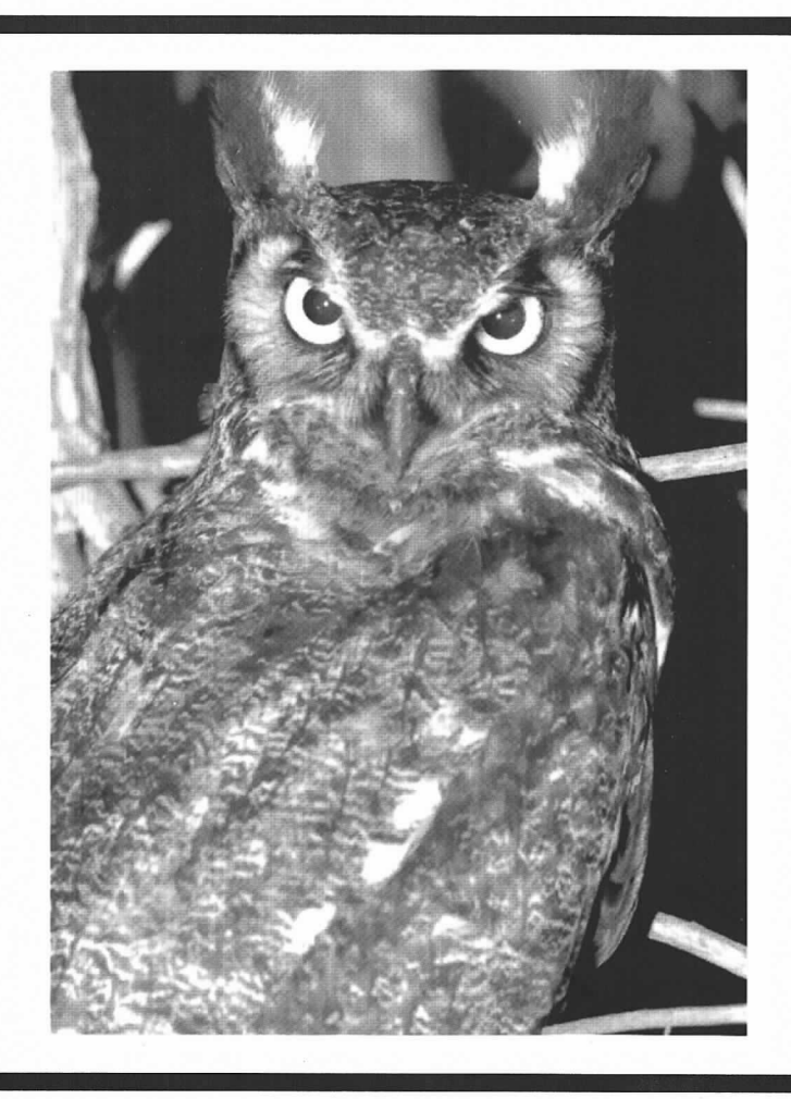
Bulletin of the Maryland Ornithological Society, Inc.