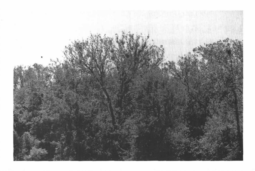
Figure 2. Sycamore tree on east side of rookery containing Double-crested Cormorant nest, the nest at the extreme left (same lens and film as in Figure 1).

Using a 40-power telescope, we counted at least 30 nests with either adult or young Great Blue Herons on every nest. The nests (Fig. 1) are concentrated in the upper branches of two large sycamore trees, at a height of approximately 60 feet above ground, directly across from the viewing area, with a few nests in a tree slightly removed to the right. When feeding was in progress, no fewer than two young were observed in the nests. The young were approximately half the size of the adults.