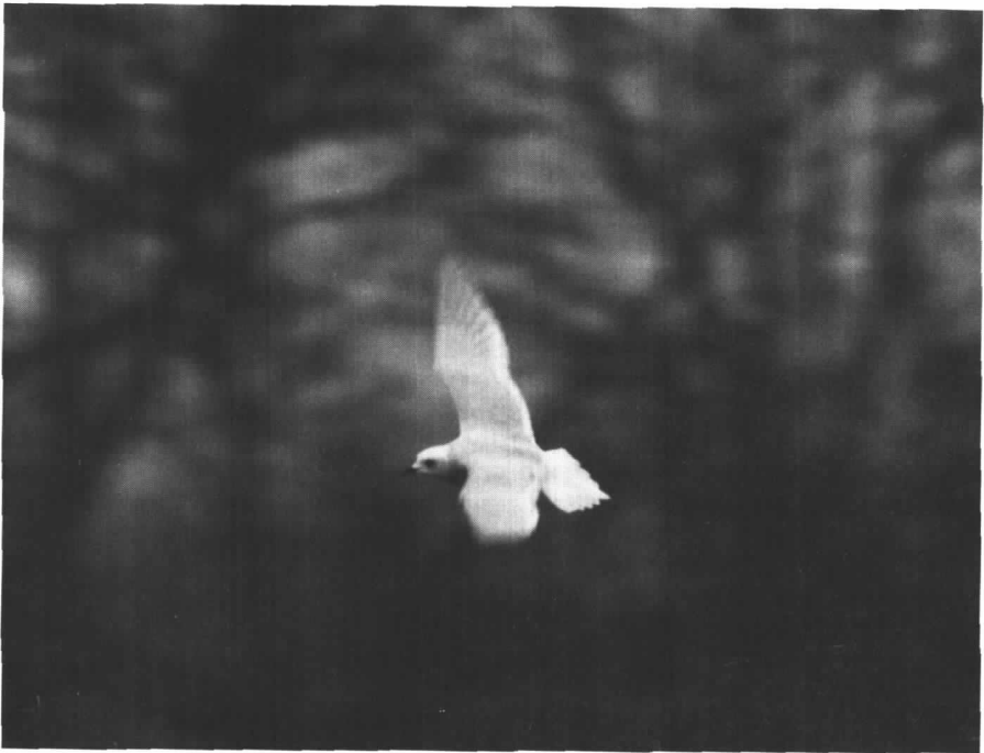
Baltimore Ross' Gull. Photo by Dave Czaplak, March 1990.

On March 12, air temperatures reached an unseasonable high of 95° F (35°C). The Ross' Gull was not seen after 2:30 p.m. that day and was presumed to have left Baltimore. The disappearance coincided with a significant drop in the number of Bonaparte's Gulls at the plant. Between March 3 and March 12, the number of Bonaparte's Gulls reported daily ranged from 500 to 1000. On March 13, only eight Bonaparte's were observed. Miliotis and Buckley (1975) reported that the Newburyport, Massachusetts Ross' Gull periodically disappeared when numbers of small gulls dropped, and reappeared when their numbers rose during its five-month stay. Bledsoe and Sibley (1985) also reported that Ross' Gulls that have stayed in one location for any length of time frequently disappear for several days when the numbers of small gulls dropped.