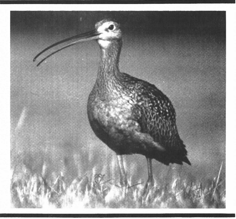
Bulletin of the Maryland Ornithological Society, Inc.