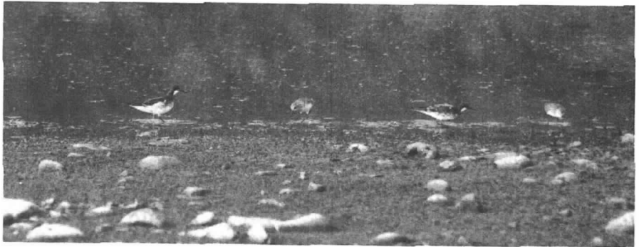
Fig. 1. Red-necked Phalaropes with Semipalmated Sandpipers at North Branch, Allegany County, June 1, 1987.

Dowitchers, Woodcock, Phalaropes. The last of the spring Short-billed Dowitchers were 14 at Ocean City on June 13, 12 there on June 21, and 9 on June 27 (Ringler); 16 were at Hart – Miller on June 14 and 7 were there on June 28 (Ringler + ). Another Short-bill at Hart – Miller on July 3 fits the pattern for fall migrants though in this unusual year it could have been going either way. Certain fall migrant Short-bills were 10 at Blackwater on July 18 (Wierenga, Ringler) and 41 there on July 25 (Davidson, Wierenga), 40 at Hart – Miller on July 19 (Ringler + ) and 80 there on July 31 (Blom), 1 at Cove Point on July 25 (Stasz) and 80 at Ocean City on July 26 (Ringler). An American Woodcock was flushed from the edge of a shopping center parking lot at 94th Street in Ocean City on June 6 and 13 (Ringler). Wilson's Phalaropes are rarely seen in the summer season but there was 1 at Ocean City on June 21 (Ringler), 1 at Hart – Miller on July 19 (Ringler + ) and 3 there on July 31 with 1 Red-necked Phalarope (Blom).