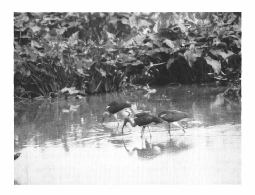
Bulletin of the Maryland Ornithological Society, Inc.