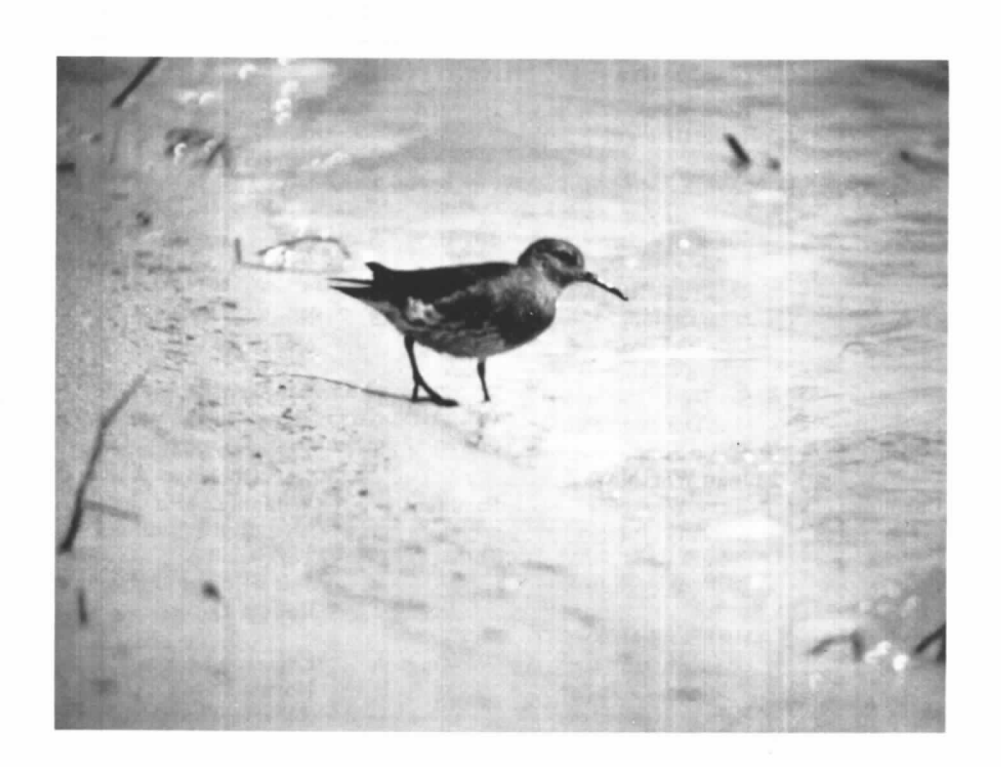
Bulletin of the Maryland Ornithological Society, Inc.