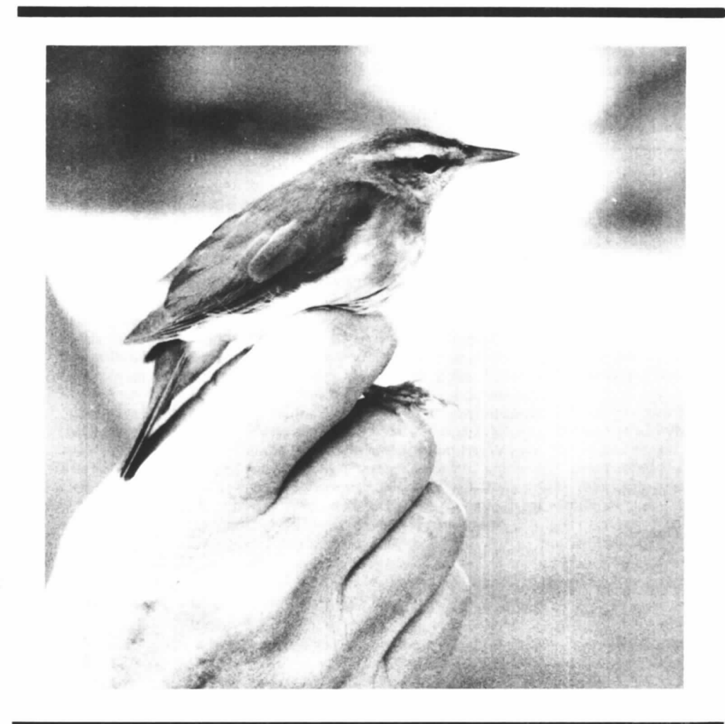
Bulletin of the Maryland Ornithological Society, Inc.