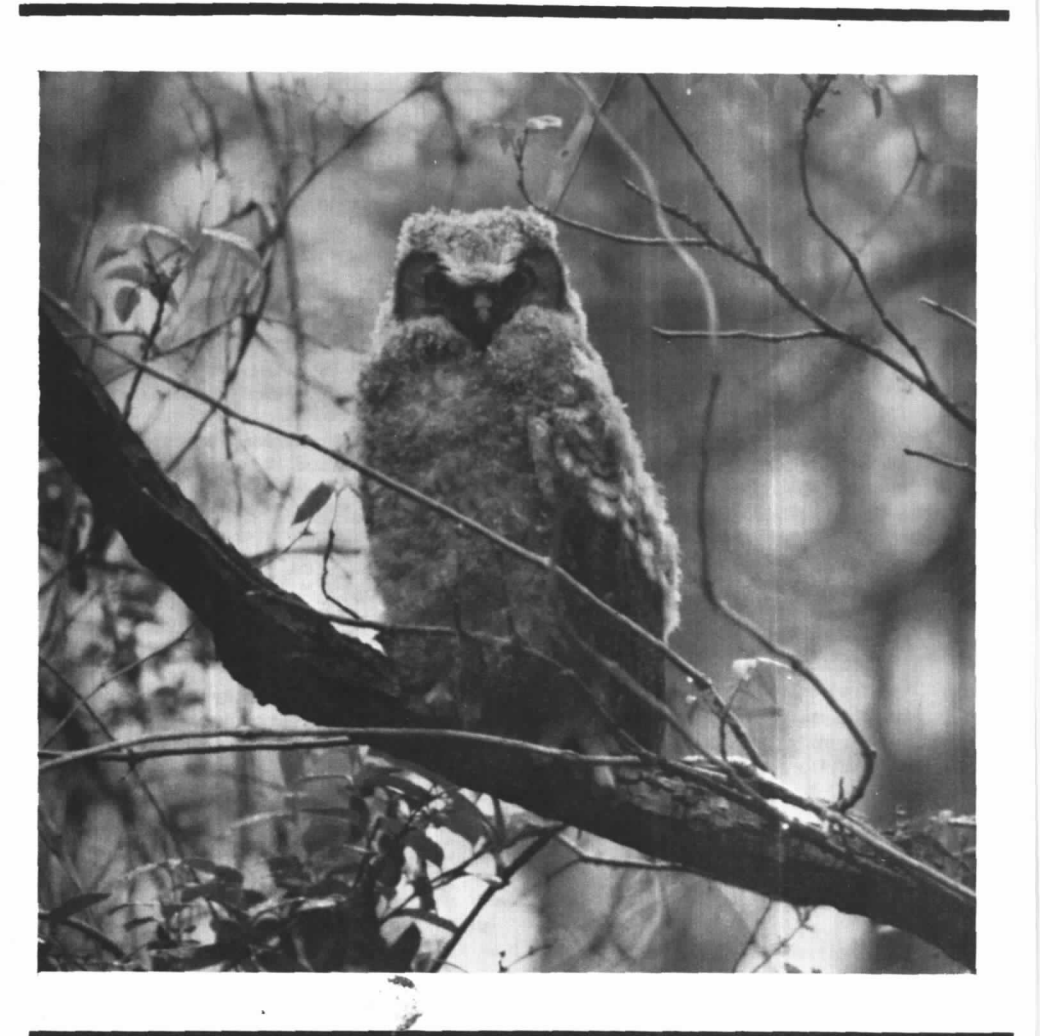
Bulletin of the Maryland Ornithological Society, Inc.