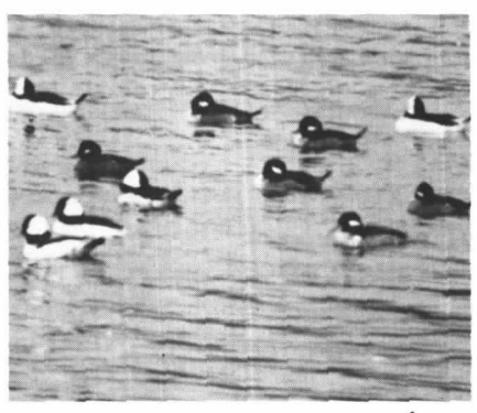
Buffleheads, Nov. 7, 1976

WHITE-WINGED SCOTER - Accidental. There were 3 on Feb. 2, 1976.