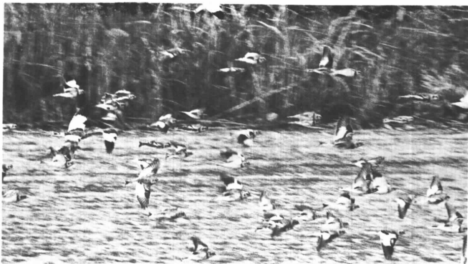
50 of 104 Snow Buntings at Sandy Pt., Nov. 27.