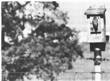
Fig. 1. Two female bluebirds feed brood of four in nest box. One immature (not shown) also helps feed the brood. Aug. 3, 1970

Certain unique observations in connection with the rearing of a brood of Eastern Bluebirds ( Sialia sialis ) seem worthy of recording. This brood was raised in one of the nesting boxes of a "bluebird trail" operated by the writer and consisting of 47 nesting boxes located on the grounds of the Agricultural Research Center at Beltsville, Maryland.