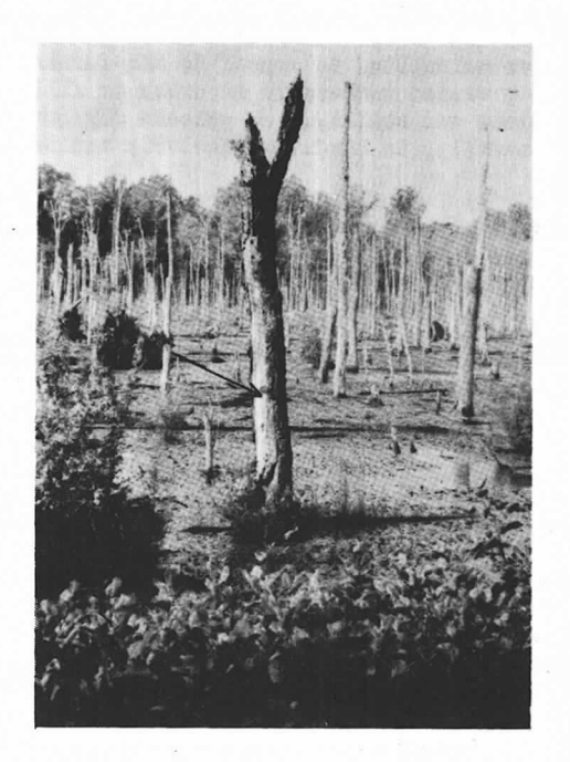
FIGURE 1. BROWN CREEPER NEST SITE

creepers during the breeding season. They were recorded by Paul and Danny Bystrak at Shad Landing State Park along the Pocomoke River in Worcester County, on July 13, 1965, and again on June 18, 1966. In addition, the Bystraks noted an adult carrying food at the Patuxent Wildlife Research Center on June 15, 1964. Observations made in this latter area during 1967 were rewarding for. on June 8, I saw an adult bird carrying food. Although the birds were quite shy, the nest was ultimately located behind a section of loose bark on an 18-foot snag which stood in 3 feet of water in one of the Center's impoundments (Duval Unit 1). The nest contained five young birds, approximately one-fourth grown. As the section of bark concealing the nest was very loose and examination of the nest imperiled the safety of the young, no additional observations were attempted. The nest tree, located in Prince Georges County, is at an elevation of