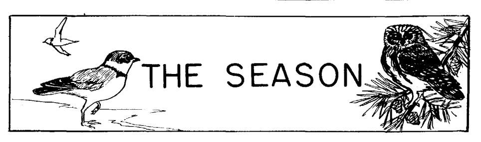
April, May, June, 1967