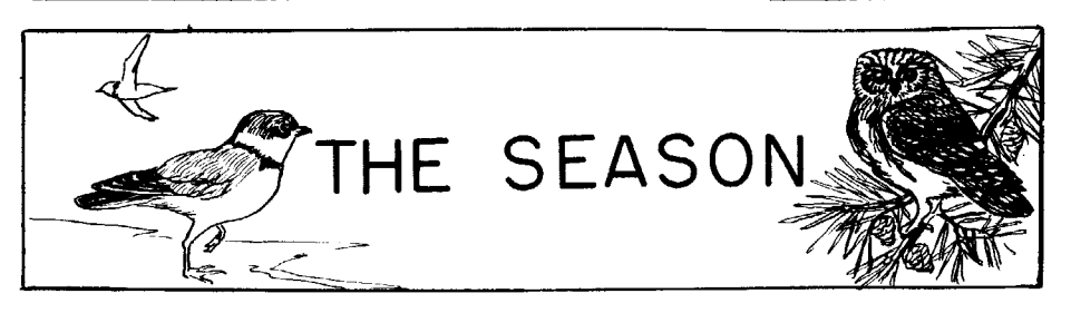
APRIL, MAY, JUNE, 1963