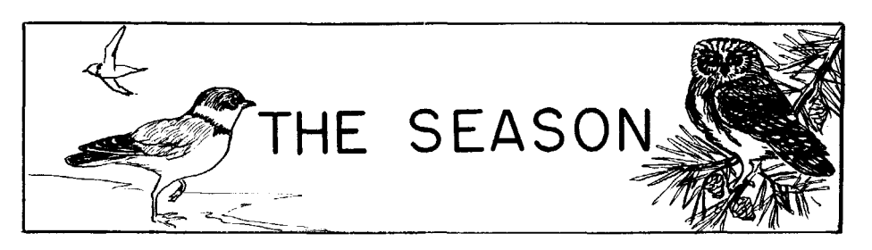
APRIL, MAY, JUNE, 1960