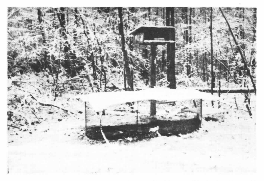
Fig. 2. All-purpose trap in operation at Monkton.

Returns are those birds that are retrapped at the station after an absence of 90 days or more. Table 1 lists the returns by species.