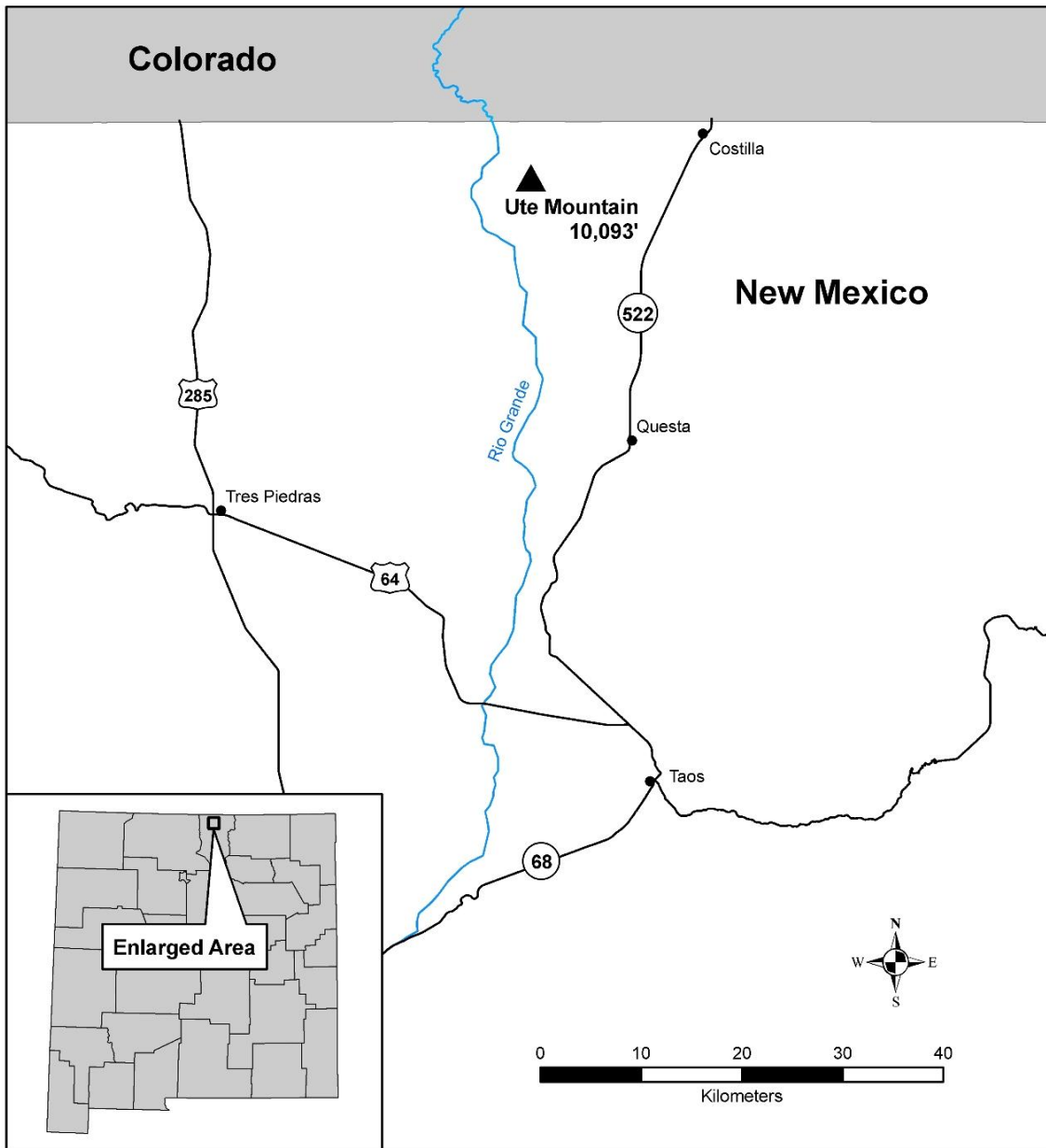
Figure 1. Location of Ute Mountain, a Bureau of Land Management acquisition, in Taos County, New Mexico.