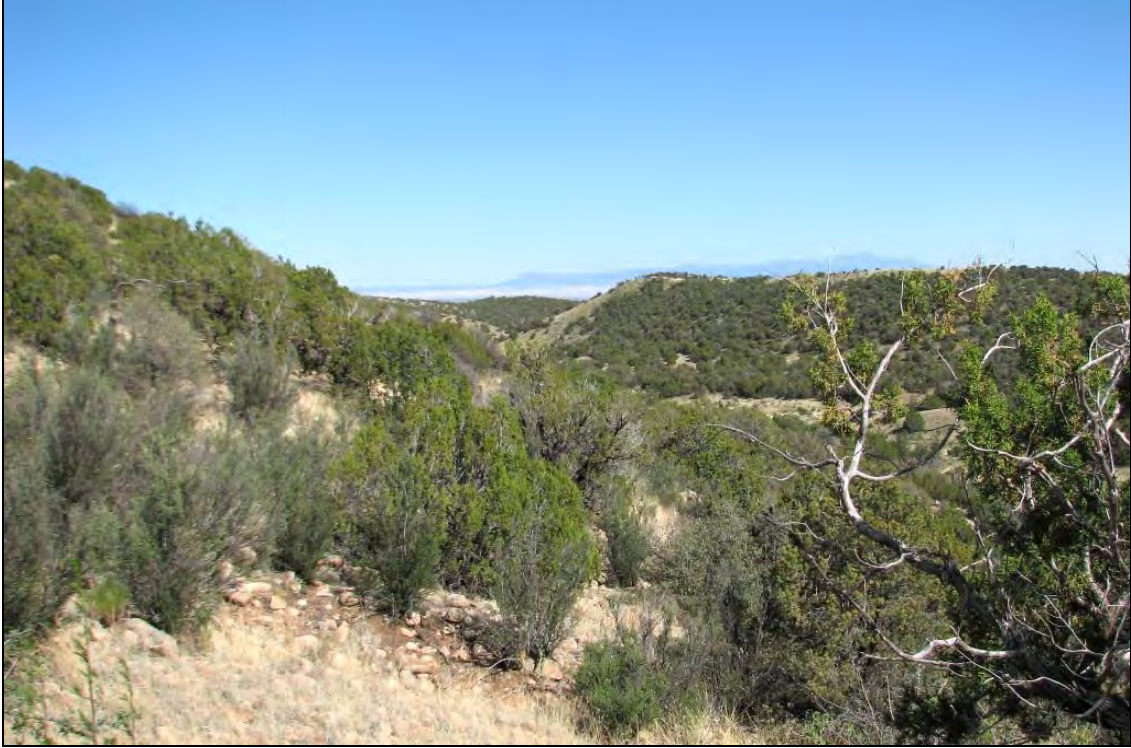
Area searched on the Chupadera Mesa (391301-3747496, North American Datum 1927).