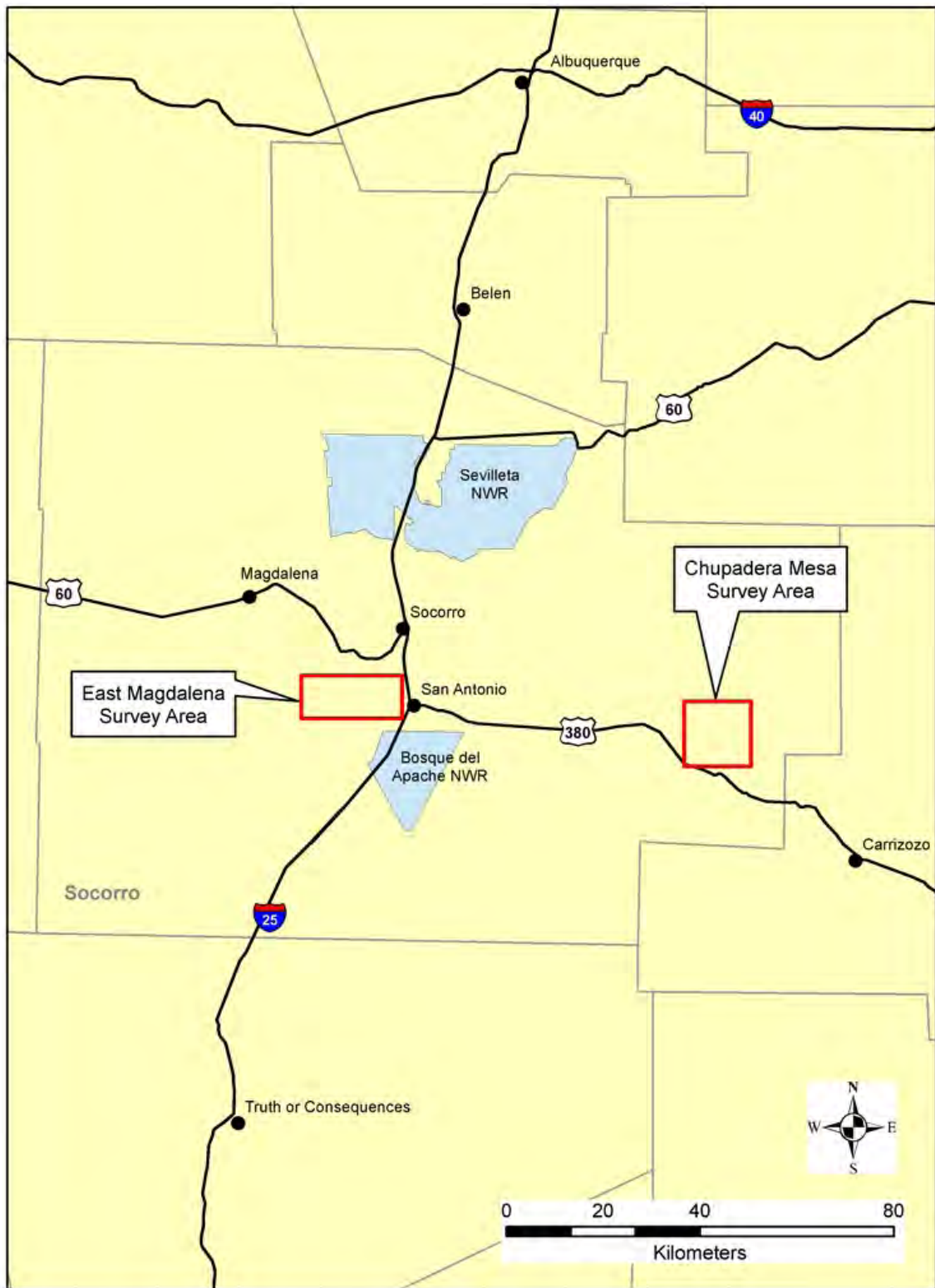
Figure 1. Location of East Magdalena and Chupadera Mesa where we conducted point count surveys in 2007 for the Bureau of Land Management, Socorro Resource Area.