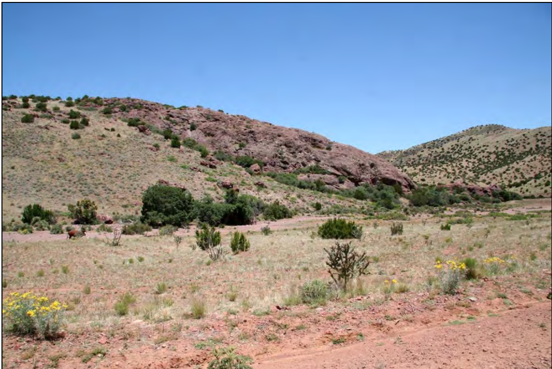
Area searched at East Magdalena (315575-3760618, North American Datum 1927).