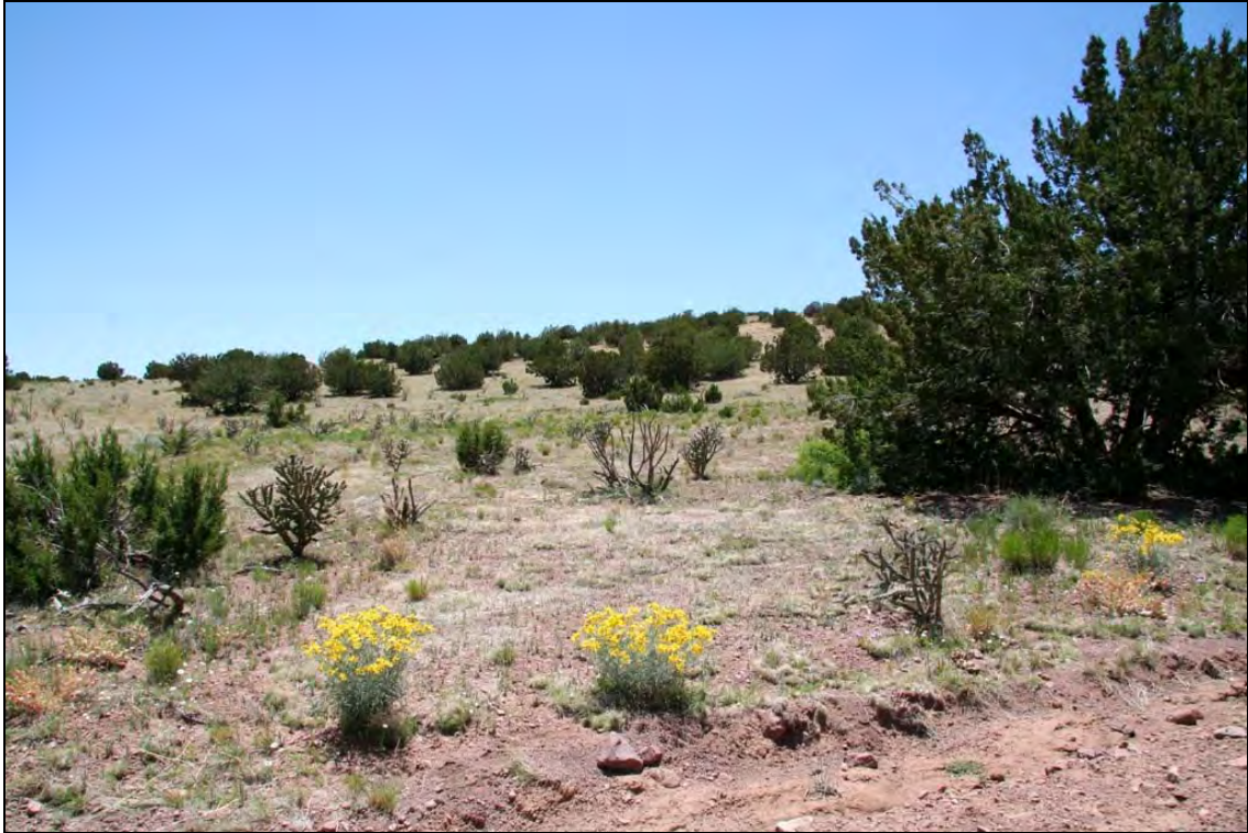
Area searched at East Magdalena (309672-3752105, North American Datum 1927).