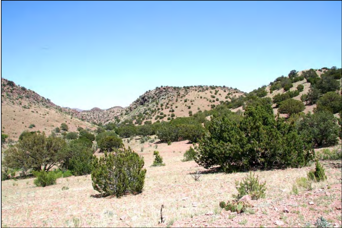
Area searched at East Magdalena (308087-3753197, North American Datum 1927).