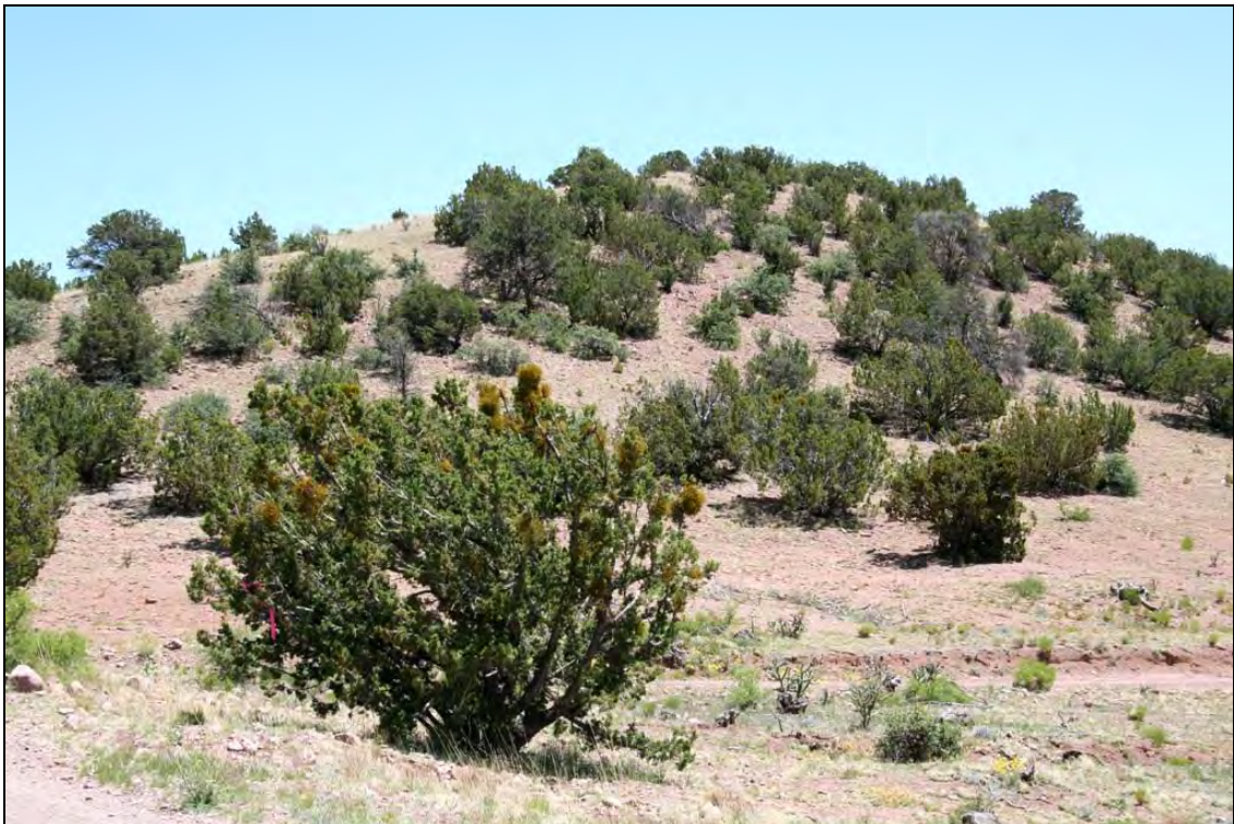
Area searched at East Magdalena (308483-3752341, North American Datum 1927).