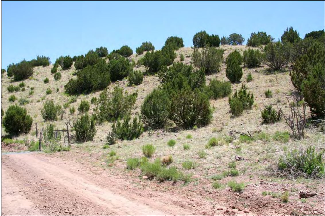
Area searched at East Magdalena (312650-3762605, North American Datum 1927).