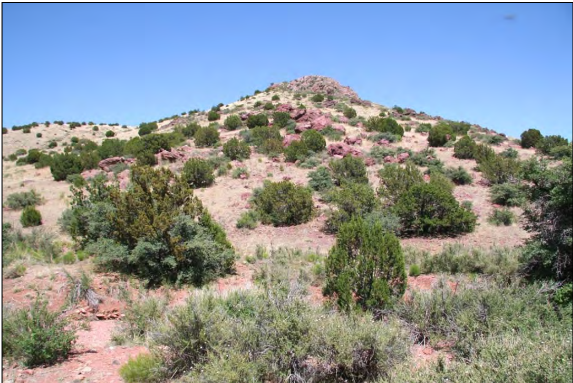
Area searched at East Magdalena (315907-3759726, North American Datum 1927).