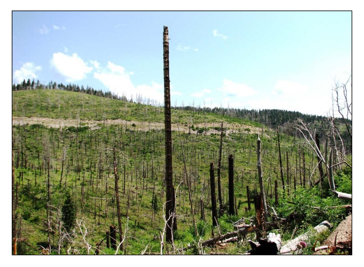
The nest snag for colony 10, like most other nest snags, was large and on a slope.

Post-fire snag management can play an important role in determining the presence and persistence of Purple Martins in the Lincoln National Forest, and elsewhere in western forests. Although a variety of taxa benefit from snags, we do not necessarily suggest that land managers avoid removing snags entirely; we recognize the economic and public safety concerns that should be balanced with wildlife management. We recommend that the Lincoln National Forest, Sacramento District, avoid impacts to documented nest sites (Appendix 1) and current areas of use (i.e., burned forest extending west from Woods Canyon, Pepper Canyon and near Pendleton Canyon), and in future post-fire management plans, allow the preservation of at least some snags that meet a profile of Purple Martin use.