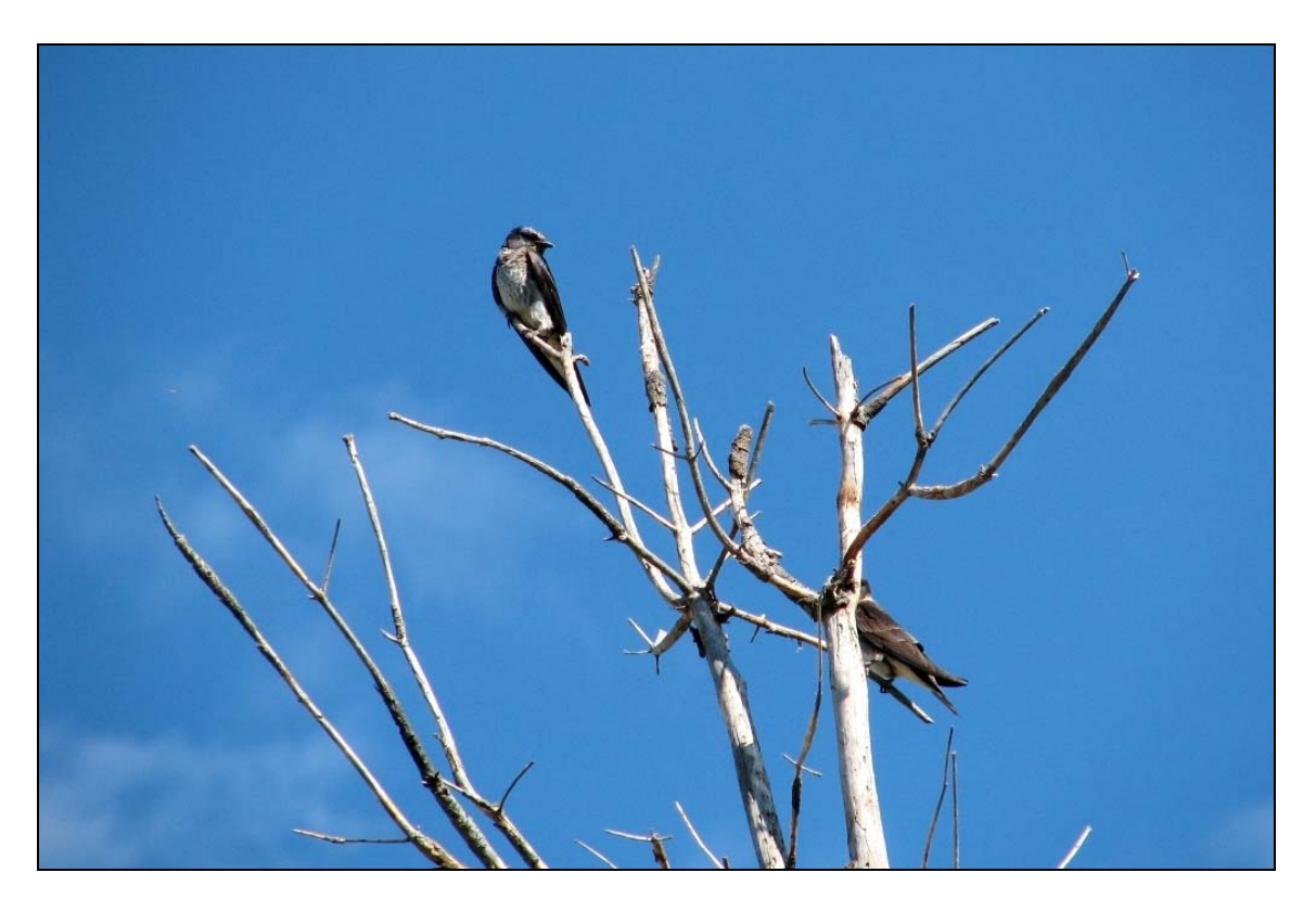
We identified perching and nesting snags while observing each colony.