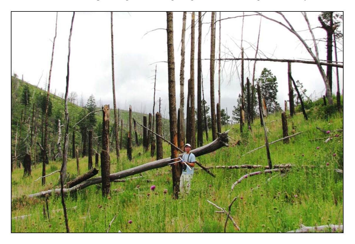
We measured perching and nesting snags after a one-hour observation period.