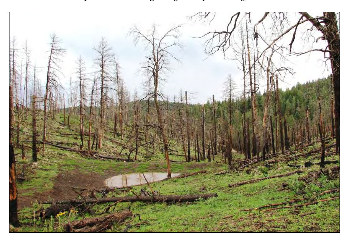
Colony 4 contained a more moderate snag density, like colonies 1 and 2.

<u>Hawks Aloft, Inc.</u> P.O. Box 10028 Albuquerque, NM 87184 (505) 828-9455 Page 11 of 19