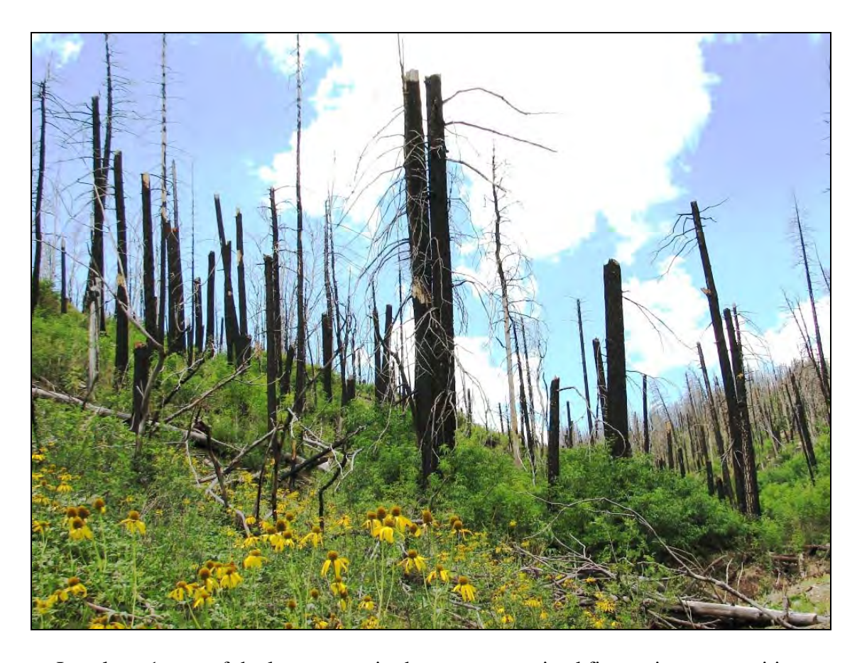
In colony 1, one of the large snags in the center contained five active nest cavities.

Colony 1 contained 16 Purple Martins using snags in the bottom of Potato-Pepper canyon, more than 300 m from the nearest unburned patch. We located two nest snags (73.1 and 30.0 cm DBH), with one and five active nest cavities each (average height for all six cavities = 10.0 \pm 5.5 m). We observed Purple Martins perching on seven different snags, with an average DBH of 31.8 \pm 12.9 cm. The understory contained mostly elder about 2 m in height, with some locust and woody debris from fallen snags. Several Violet-green Swallows and Western Bluebirds were present along the periphery of the colony, and one swallow was seen briefly chasing a Purple Martin. The elevation at colony 1 was 2,616 m.