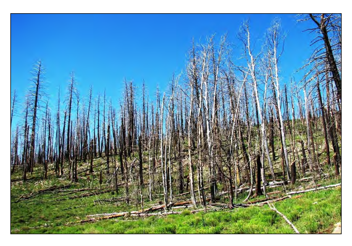
Colony 3 contained a high snag density bordering a meadow.