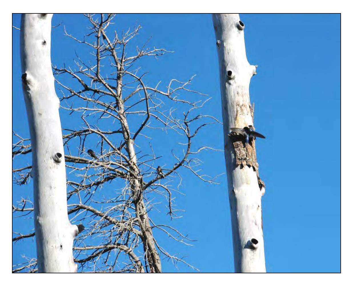
Purple Martins in colony 2 visit a cavity (right) while two other martins perch nearby.

Colony 2 contained 11 Purple Martins using snags along a burned hillside in Woods canyon; a portion of this colony bordered an unburned patch of forest. We found six nest snags clustered in two locations about 100 m apart. We found only one active nest cavity per snag, except for one snag which contained two cavities. Average DBH for nest snags in colony 2 was 33.6 \pm 4.7 cm and average cavity height was 7.3 \pm 1.3 m. We observed Purple Martins perching on 20 different snags, with an average DBH of 33.8 \pm 6.7 cm. The understory was mostly bare with woody debris in the northern section, whereas the southern section contained a thick locust understory. Violet-green