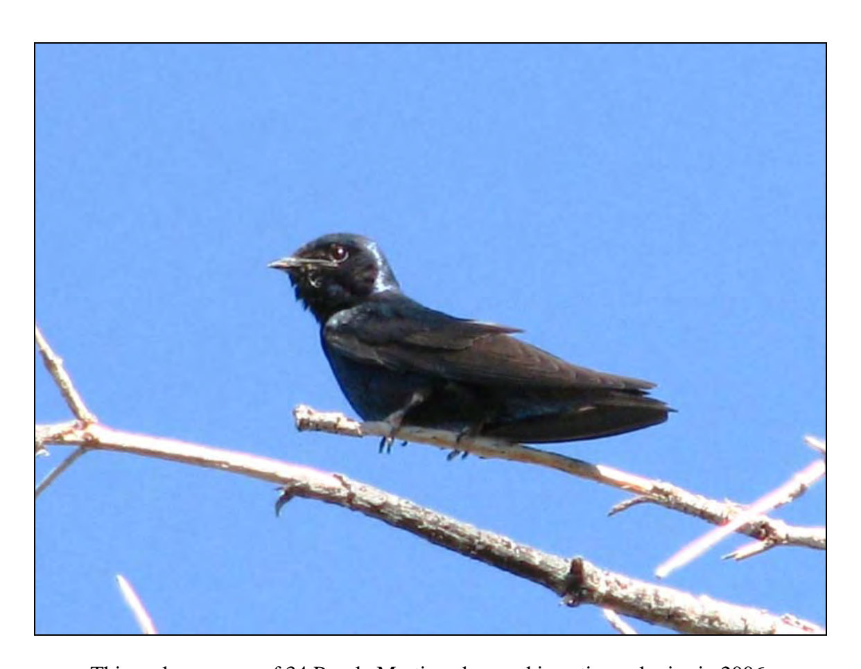
This male was one of 34 Purple Martins observed in active colonies in 2006.

We observed a total of 34 Purple Martins at the four active colonies in 2006. Most of the martins (N=27) were observed at colonies 1 and 2; we observed only four martins at colony 3 and three martins at colony 4. Among the four colonies, we documented 10 active nest trees containing at least 15 active nest cavities. We observed eight nestling Purple Martins at cavity entrances, although we noted parental feeding visits to all 15 cavities. Average DBH for nest trees was 37.2 \pm 8.4 cm (95% confidence interval) (range = 26.4 - 73.1 cm), and the average height of cavities was 8.5 \pm 1.1 m (range = 5.2 - 12.2 m). We measured 44 snags used as perches by Purple Martins in the colonies. Average DBH for perching snags was 33.2 \pm 4.5 cm (range = 16.3 - 80.0 cm). Below, we present data and observations specific to each colony.