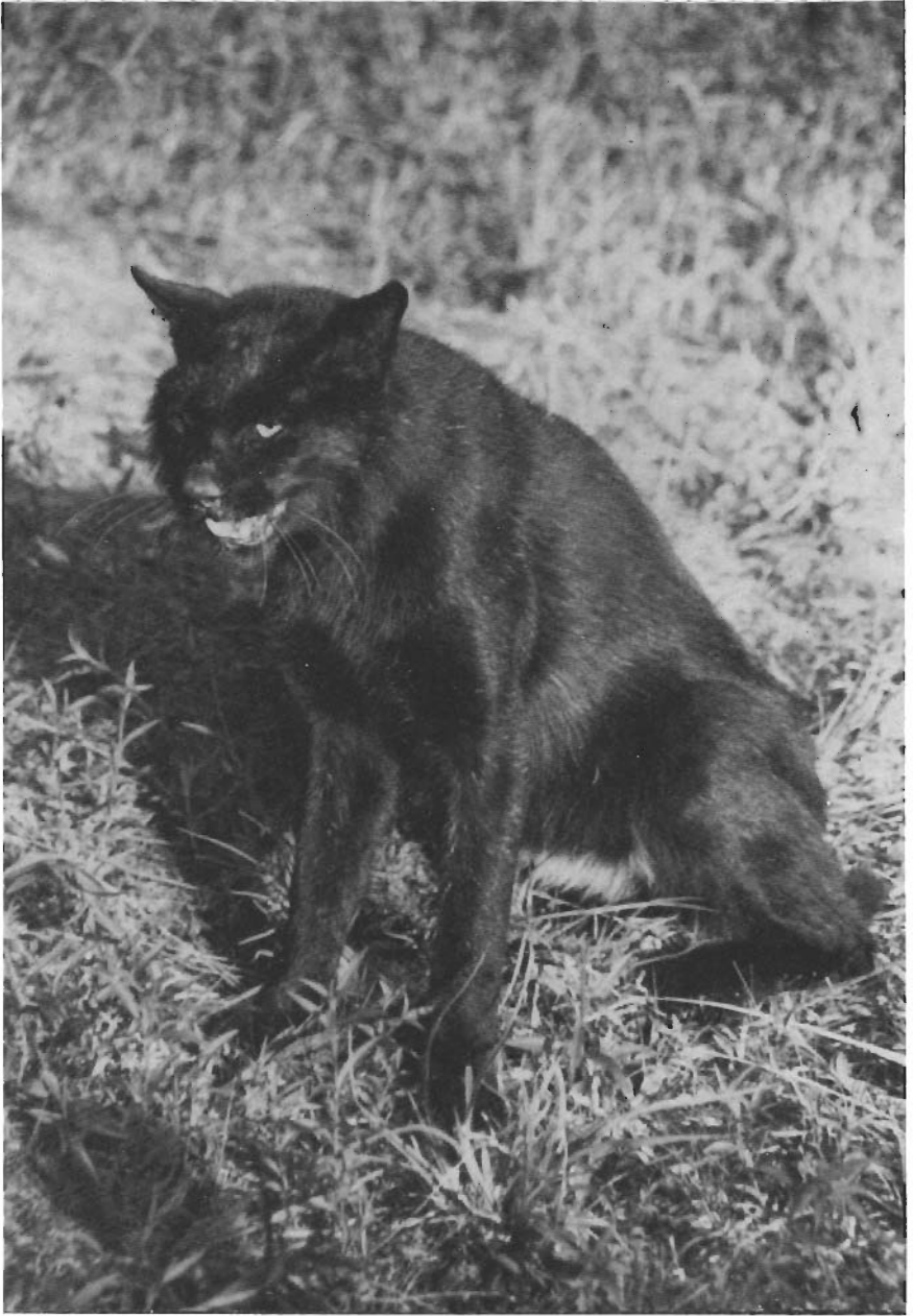
Figure 2. A melanistic bobcat captured in Polk County, April 1990.