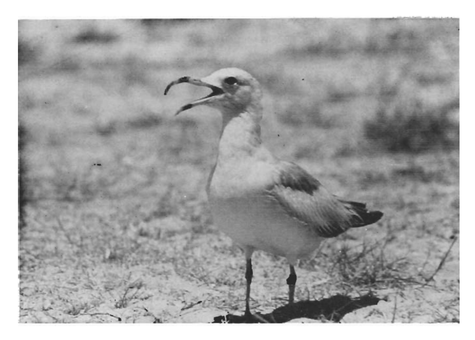
Figure 1. Ring-billed Gull with an abnormally long bill photographed at Cedar Key, Florida in May 1983.

Fox, W. 1952. Behavioral and evolutionary significance of the abnormal growth of beaks of birds. Condor 54: 160-162.