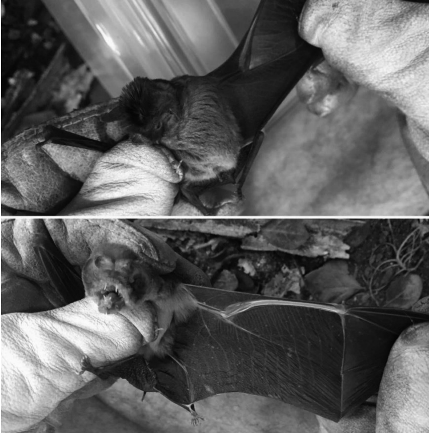
Figure 2. The two individuals captured in Great Lake cave on Long Island, The Bahamas, in January 2017. Top: sooty mustached bat ( Pteronotus quadridens ). Bottom: Antillean ghost-faced bat ( Mormoops blainvillei ).

Hurricane-influenced disturbances on bat populations are not uncommon, where they can suppress populations, cause mortalities, and alter genetic diversity (Gannon and Willig 1994, Jones et al. 2001, Rodríguez-Durán and Vázquez 2001, Fleming and Murray 2009, Pederson et al. 2009). Further, there are several examples in the West Indies where a hurricane is the only likely explanation for the documented presence of unlikely bat species in new areas (Kwiecinski and Coles 2007, Gannon and Willig 2009, Pederson et al. 2009, Rivas-Camo 2020). Hurricane-assisted records such as these are important to document the role such storms may play in assisting species to colonize new areas and altering genetic diversity in existing populations.