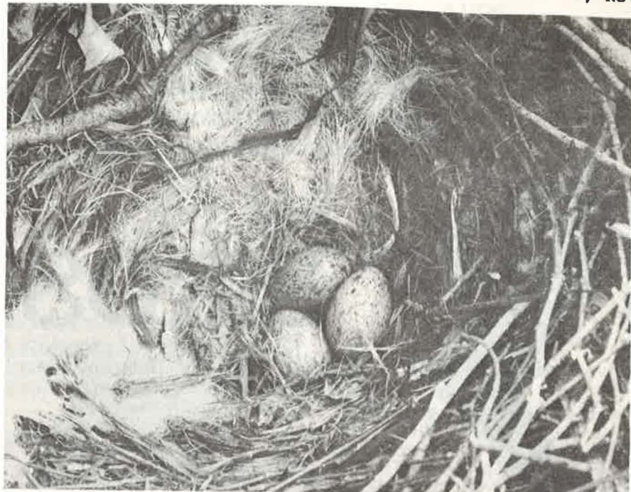
March 1974. Probably the last clutch of eggs. Notice the deer hair.