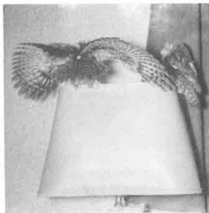
(6) "Come on, I'll show you how!"