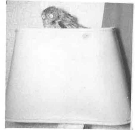
(2) "Do you really think so, Elmer?"