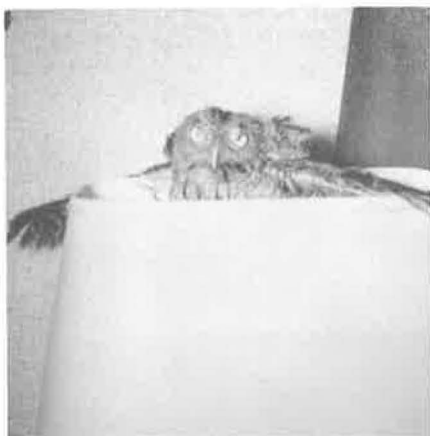
(7) "Yeh, Elmer, thish is great stuff! Hic!!!"