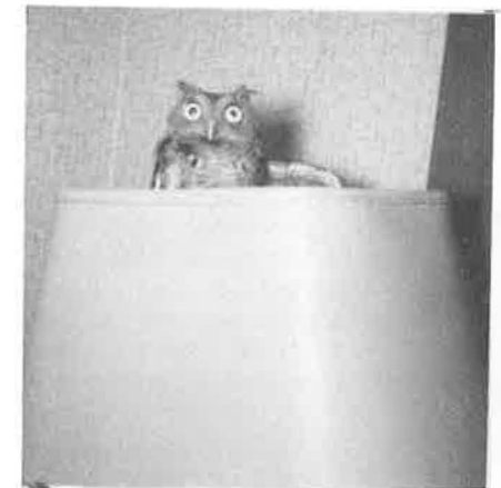
(4) "Like this, Elmer?"