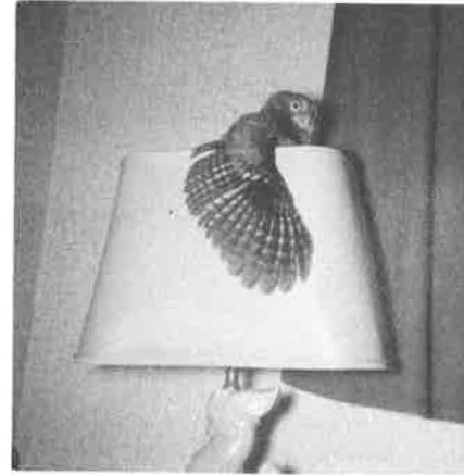
(1) "Hey Squeaky, I think maybe we can get a sunbath with this lamp!"

81 Hope Road, New Shrewsbury, N.J. 07724