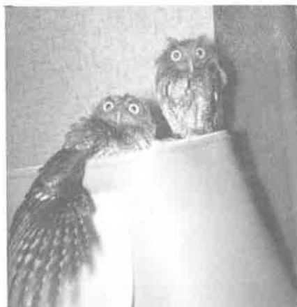
(8) "Gee, Ma, we didn't hurt the lamp. We only wanted a sun-bath!"