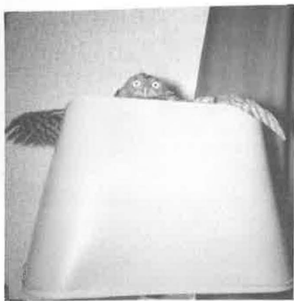
(5) "No, Squeaky, you gotta really throw yourself into it!"