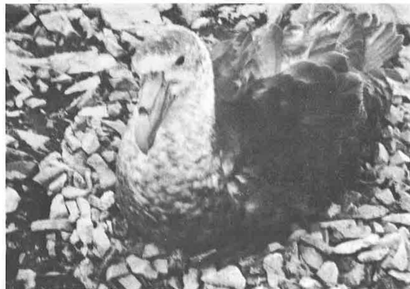
Adult Giant Petrel

The Giant Petrel usually lays its single egg on a rather high spot and in more exposed areas than does the Skua. In the early stages of nesting it will readily desert the nest, but later on, when the chick is present, it is hesitant to do so. If an observer forces the bird off the nest it has a hard time getting its heavy body airborne unless there is a strong headwind. It will bounce from rock to rock, with its long wings outstretched, like a crippled piper cub, until it can get airborne. When it finally does get into the air it is extremely graceful.