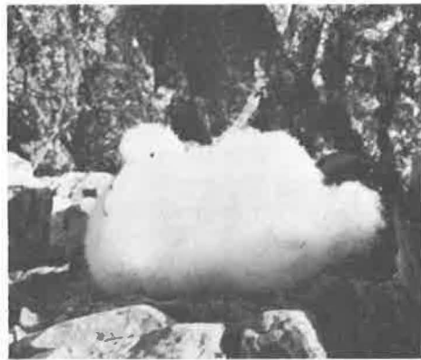
At the left: adult Skuas; at the right, a Giant Petrel chick (white phase).