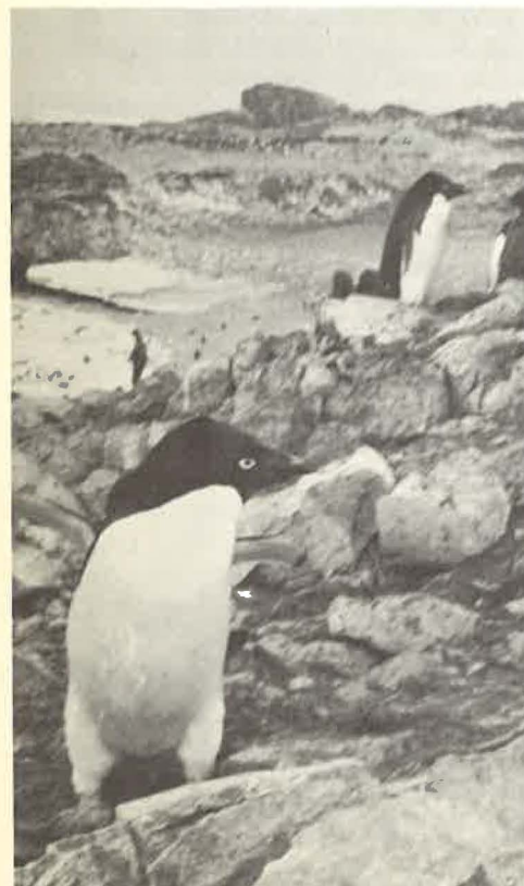
Left: Adelie Penguin (Adult)

A common winter bird, though rarely found in the summer, is the Sheathbill, a member of the sandpiper order (Charadriiformes). This bird is snow white, and looks more like a small white chicken than a sandpiper. Only two nests of this scavenger have been found near Palmer, though they are common throughout the Antarctic Peninsula.