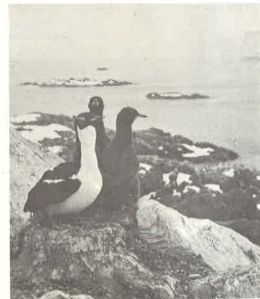
Below: Blue-eyed Cormorant (Adult and three chicks)